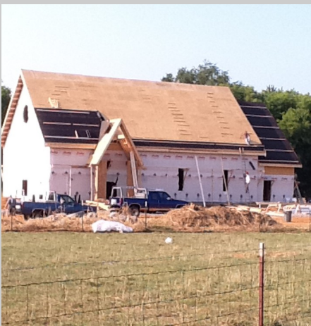
Construction on the new church building is underway at St. Patrick's Anglican Church in Smyrna, TN. (above)